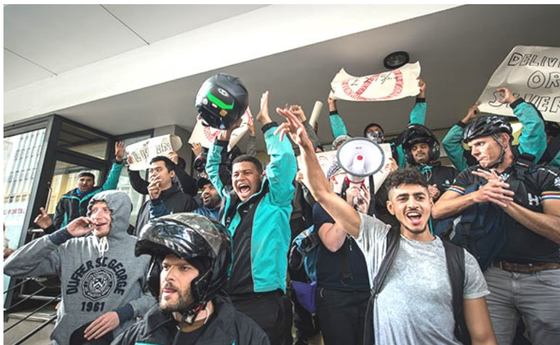
The gig economy of zero hours contracts in Deliveroo couriers (above), the McDonald's workers and the disorganised construction sites where agency firms collude with corrupt union officials to maintain the profits of the big firms cry out for a fightback.

Our allies are the global working class; we strongly hold that migrant rights are workers' rights. The gig economy of zero hours