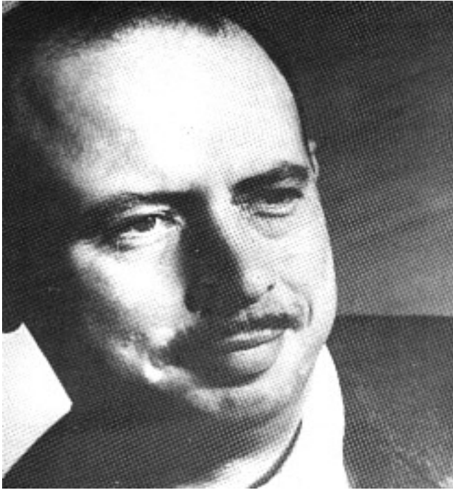
Max Shachtman: the struggle against Shachtman and his followers in 1939-40 was not just some obscure debate about how exactly revolutionists should characterise the USSR.

respondence with the IST, which also revealed the IST's stunningly cynical attitude toward the prospects for working-class revolutionary struggle in the Middle East: the IST advised the ISL to give up their efforts and move to Britain![6]