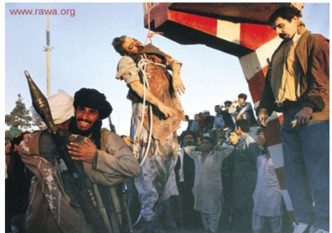
Mohammad Najibullah Ahmadzai (right) President of Afghanistan 1987 - 1992. The CIA celebrated when he was tortured, mutilated and lynched by the Taliban on 27 September 1996.

Of course there were many sincere but politically naïve anti-Imperialist and anti-Gaddafi-Assad revolutionists in Libya and Syria when the uprisings broke out; they supplied the forces for the first uprisings. But reactionary leaders and Imperialist sponsorship quickly swept them into political oblivion. The CIA surely plotted furiously in Libya, but it was the Saudis and the Qataris who did that in Syria – right from the outset they had armed forces in the ground who opened fire on the army and police dur-