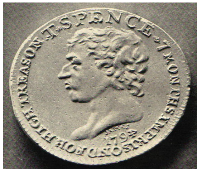
Spence token, ‘T. Spence. 7 MONTHS IMPRISONMENT FOR HIGH TREASON. 1794

Spence’s revolutionary plan never came to fruition. His