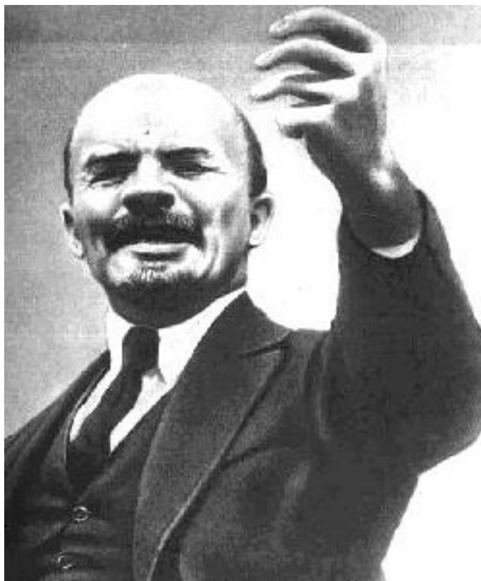
Lenin speaks before the delegates to the Third Congress of the Comintern, 1921. The revolutionary Comintern opposed the opportunist adaption of the Anti-Imperialist United Front by which Stalinism and others later capitulated to bourgeois nationalism.

If you substitute Gaddafi and Assad for the 'Islamists' that was the policy of the LCFI for Libya and is for Syria today. It is, in fact, a clear elucidation of the principles of the Anti-Imperialist United Front. Except the LRP have great problems with proxy forces acting on behalf of Imperialism. Their Shachtmanite origins oblige them to defend the political cowardice of Burnham, Shachtman, Carter and their middle class milieu which Trotsky and the revolutionary US SWP fought as recorded in In Defence of Marxism . Their traditional softness on Imperialism on the