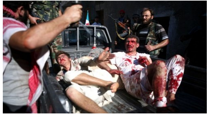
This image shows the Free Syrian Army about to kill captured opponents. Of course the Assad government are guilty too.