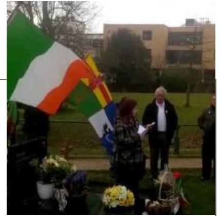
RSF Easter Monday 2013, Paddington Cemetery, Willesden Lane, Kilburn NW6, London

Finally to the international struggle against imperialism and solidarity;- Because there the majority of so-called independent media are in fact aligned to different political parties, it is important that those involved in various struggles, whether for independence or against imperialism to co-operate in highlighting just causes. Governments across the globe are trying to stifle the independent voice of the oppressed. The likes of the Irish, Basque and Palestinian struggle are well known but it is getting harder for us to get the word out there that oppression continues and injustice is an everyday fact of life. The case of Mohammed Hamid is known to us in Sinn Féin Poblachtach, in 2011 the CPS attempted to use his case as a precedent against one member who was interviewed by Channel 4. The fact that people going out paint-balling can be used to infer guilt of terrorist training is very worrying. This in stark contrast to a statement made in Dec 2011 where Jeremy Clarkson said he would have Public Service workers shot for striking. Comrades we need to build a strong anti-imperialist movement where the plight of ordinary men and women are put ahead of the rich and powerful. From here today we should agree to highlight each others ongoing struggle; as long as this does not impinge on our own principles.