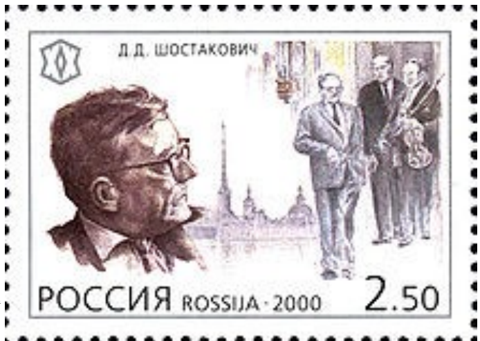
A Russian stamp in Dmitri Shostakovich's memory in 2000

In 1953 when Stalin died and Khrushchev became General Secretary, immediately with the revelations about the Stalinist lies and double talk a political thaw developed and Shostakovich was allowed to compose his music relatively safe from state interference. His 13 th symphony (Babi Yar) composed of poems from Yevtushenko details the role of anti-Semitism practised by Stalinism.